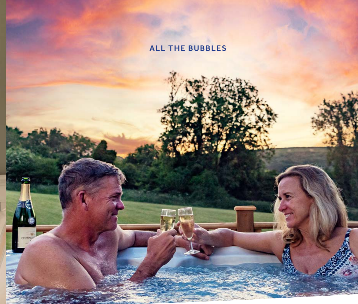
ALL THE BUBBLES