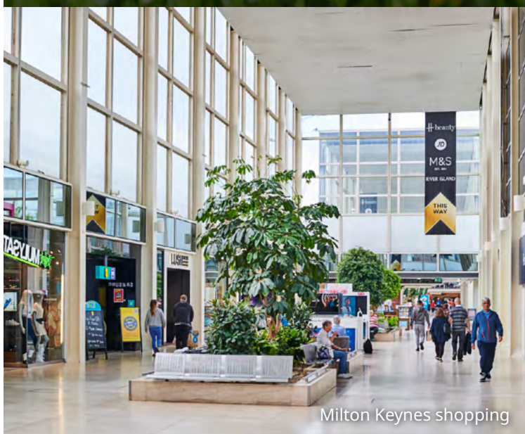
Milton Keynes shopping