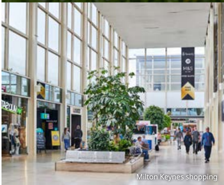
Milton Keynes shopping