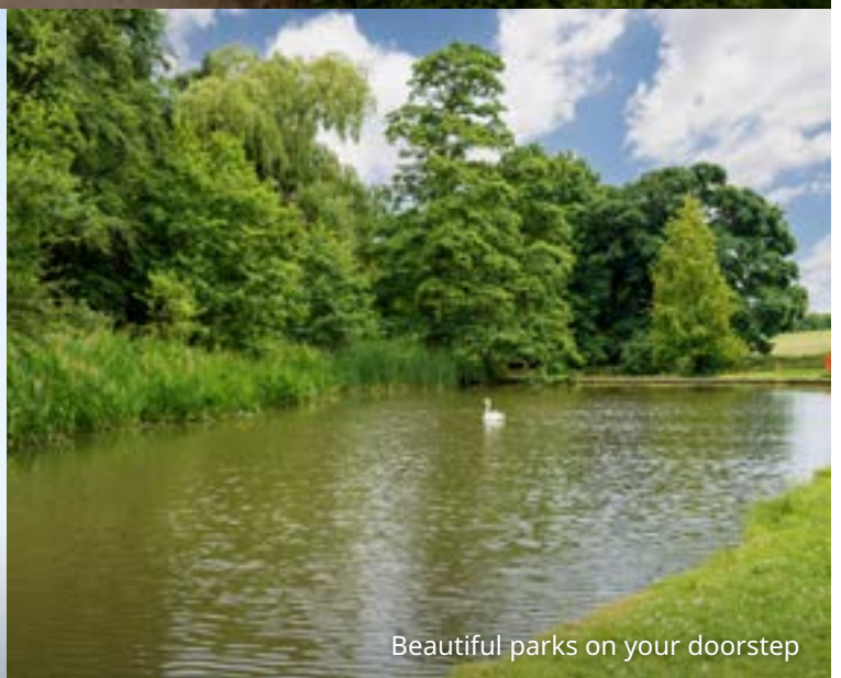
Beautiful parks on your doorstep