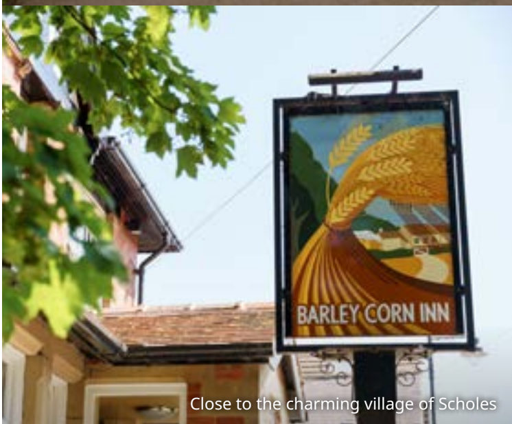
Close to the charming village of Scholes

Newsam Park offers picturesque walks and beautiful green space