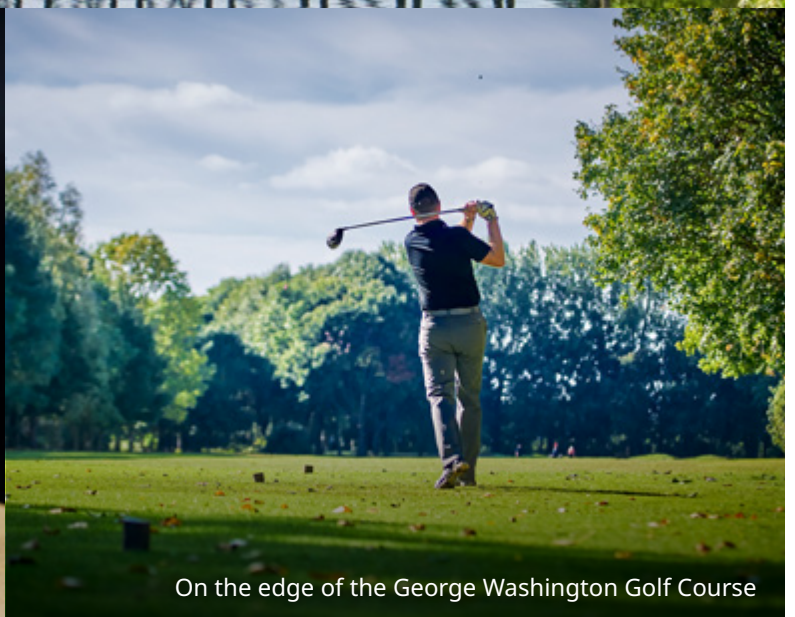
On the edge of the George Washington Golf Course