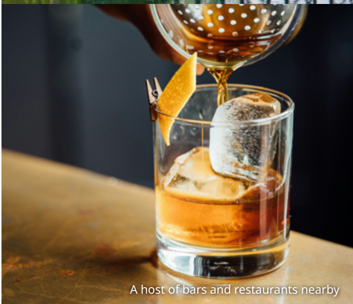
A host of bars and restaurants nearby