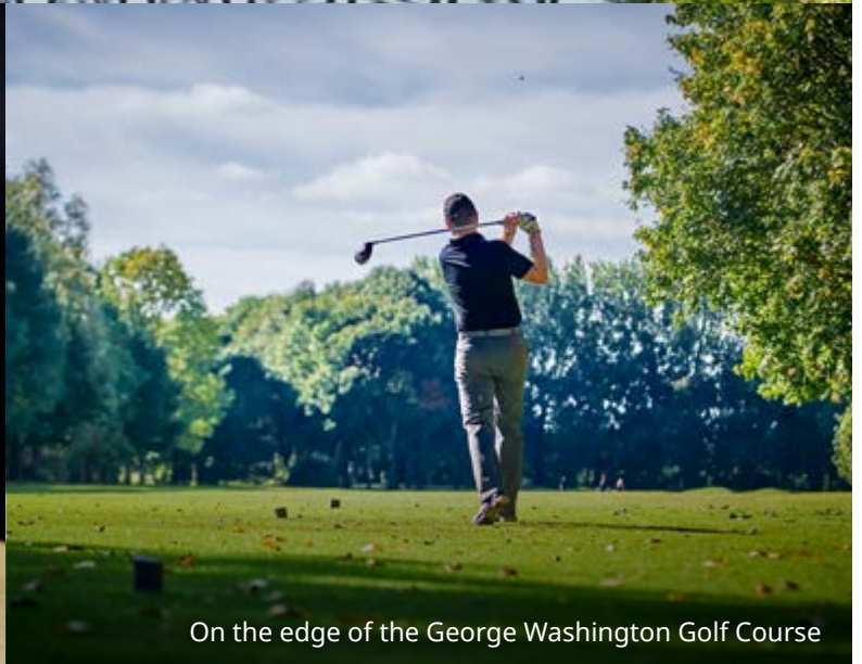
On the edge of the George Washington Golf Course