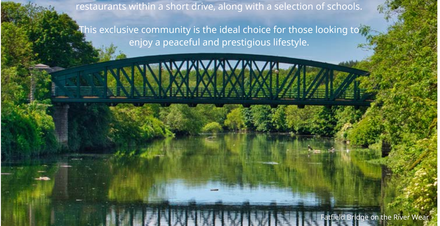
Fatfield Bridge on the River Wear

This exclusive community is the ideal choice for those looking to enjoy a peaceful and prestigious lifestyle.