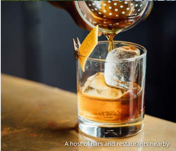
A host of bars and restaurants nearby