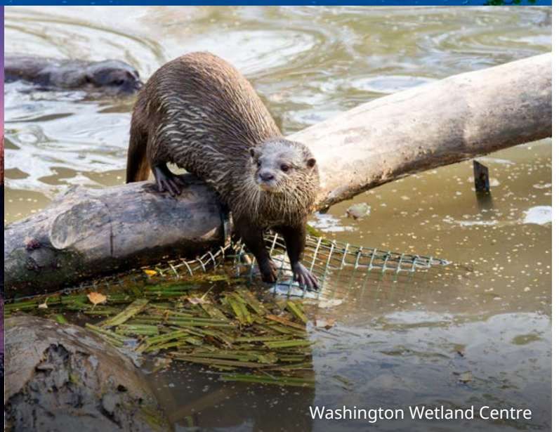
Washington Wetland Centre