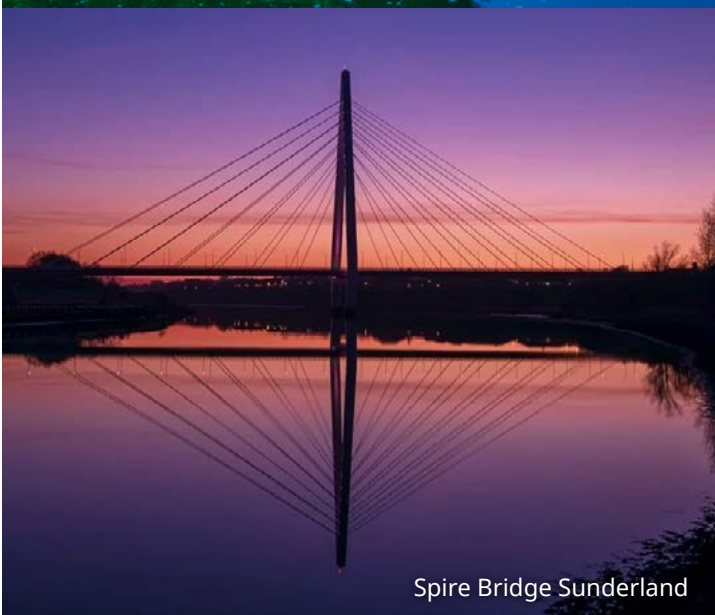
Spire Bridge Sunderland