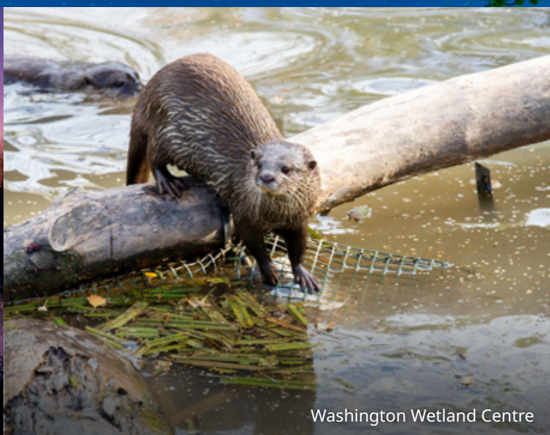
Washington Wetland Centre