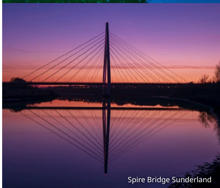
Spire Bridge Sunderland