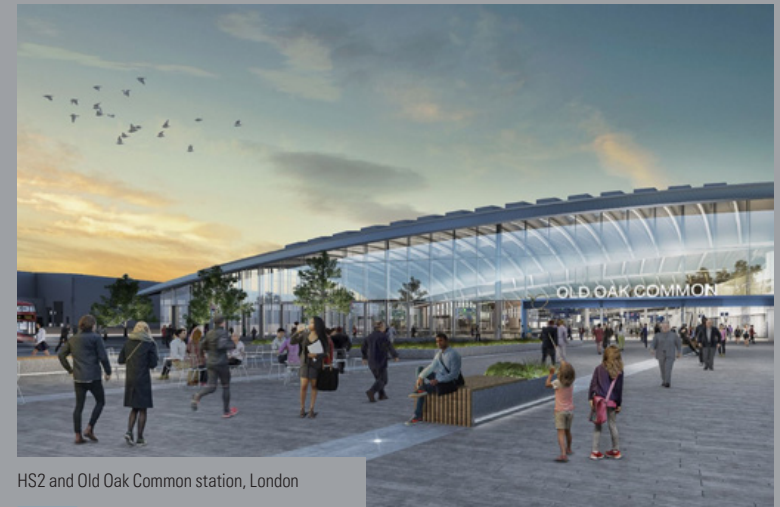
HS2 and Old Oak Common station, London