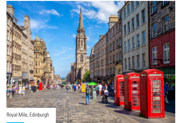
Royal Mile, Edinburgh