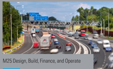
M25 Design, Build, Finance, and Operate