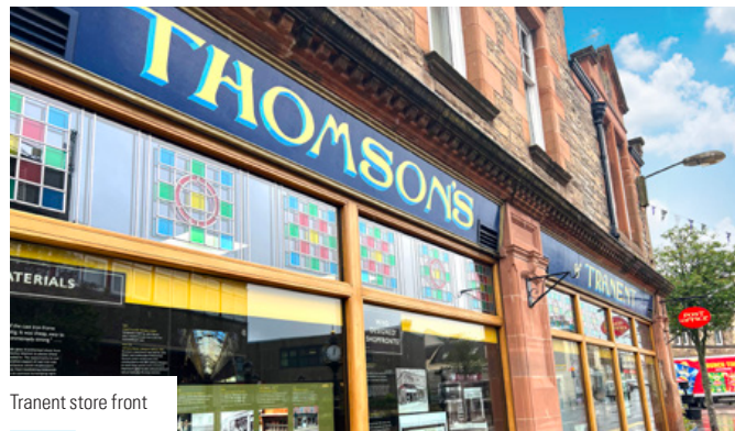
Tranent store front