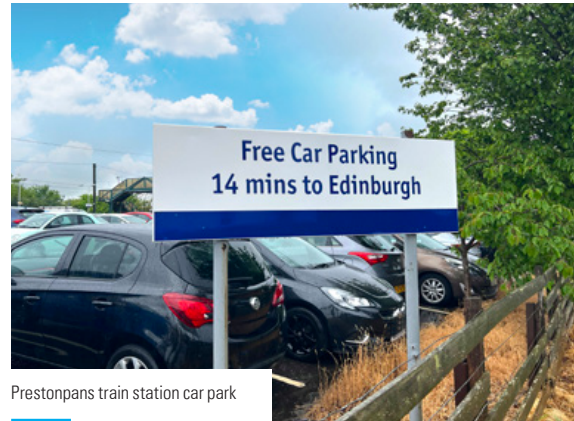
Prestonpans train station car park