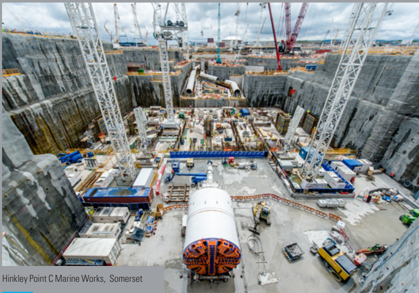
Hinkley Point C Marine Works, Somerset