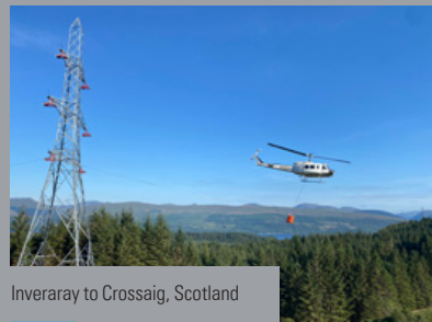
Inveraray to Crossaig, Scotland