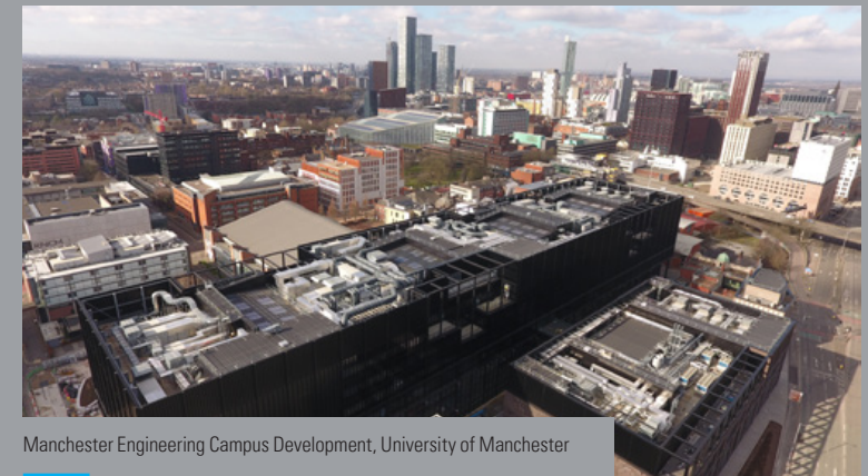
Manchester Engineering Campus Development, University of Manchester