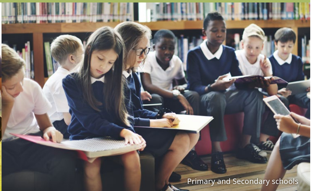
Primary and Secondary schools