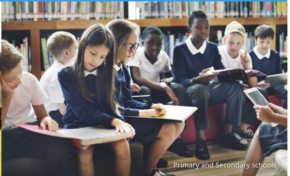
Primary and Secondary schools