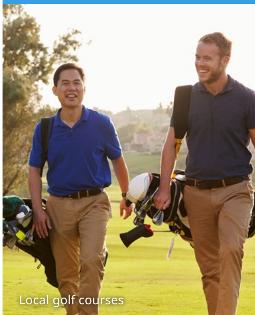
Local golf courses