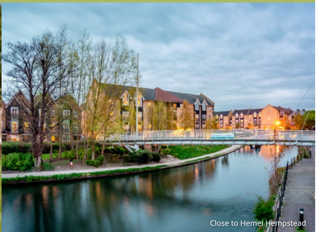
Close to Hemel Hempstead