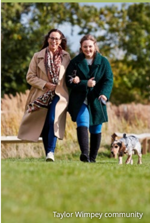
Taylor Wimpey community