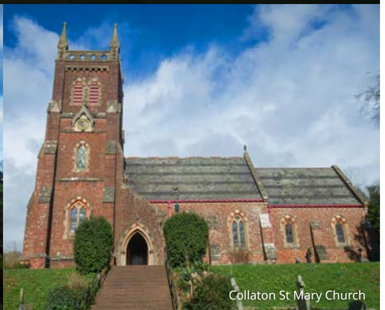
Collaton St Mary Church