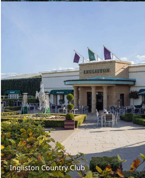
Ingliston Country Club