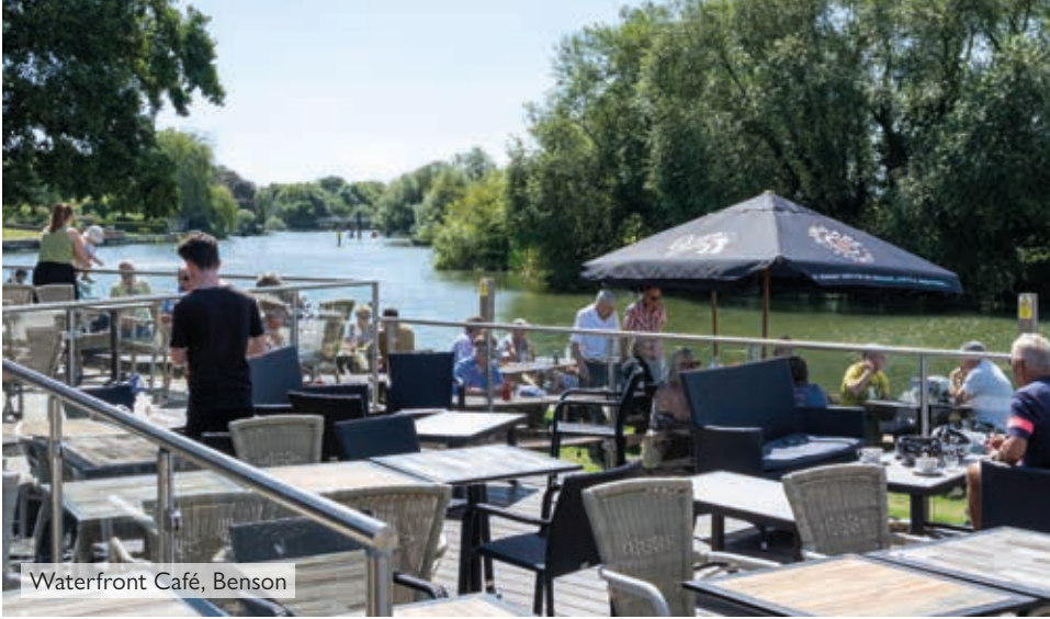
Waterfront Café, Benson