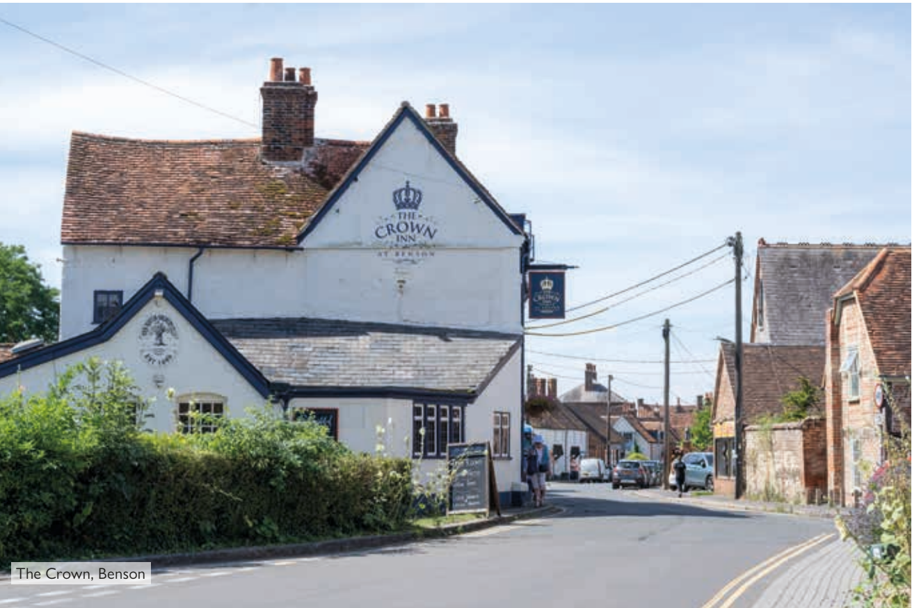
The Crown, Benson