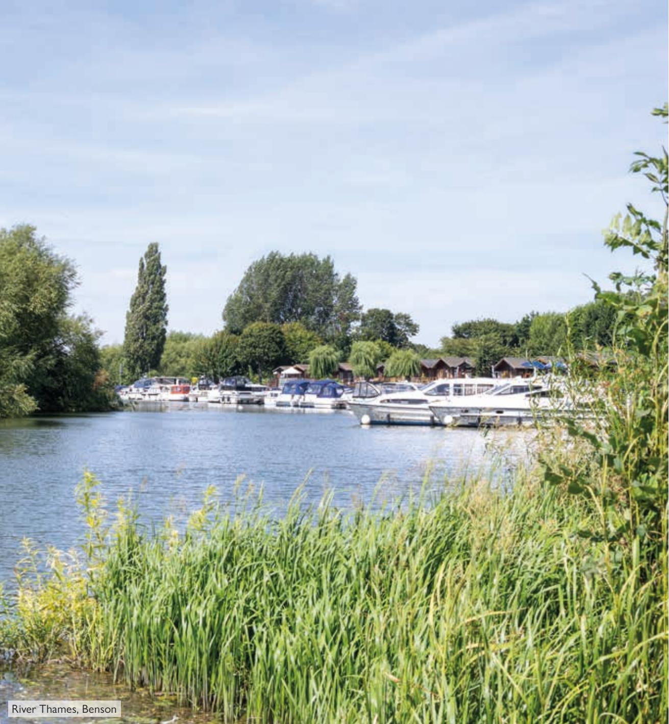
River Thames, Benson

Lifestyle photography is indicative only. Travel times from Google Maps are approximate only.