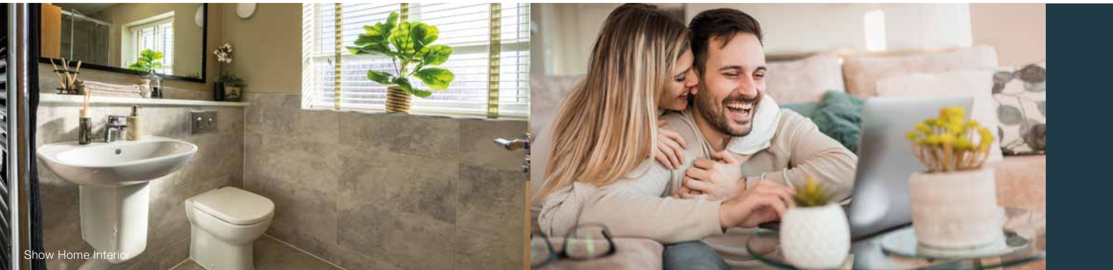
Show Home Interior

Most of all, once you step through the front door, we want you to know you're home.