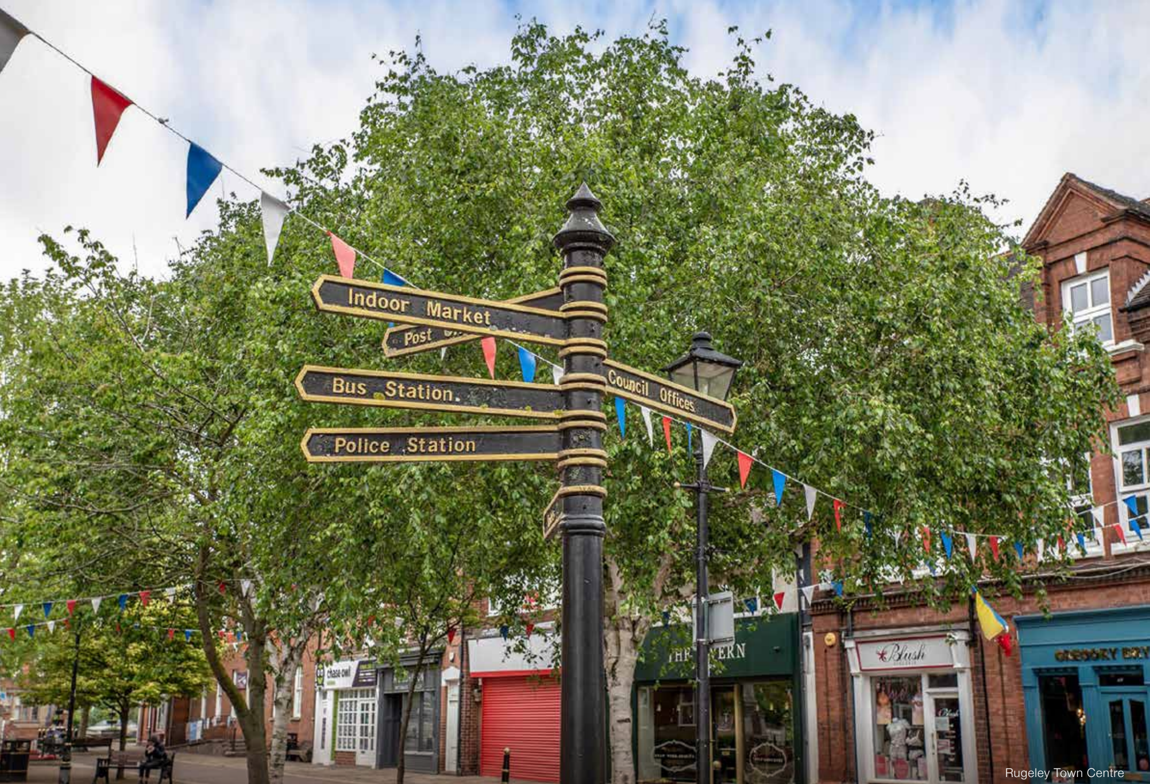
Rugeley Town Centre