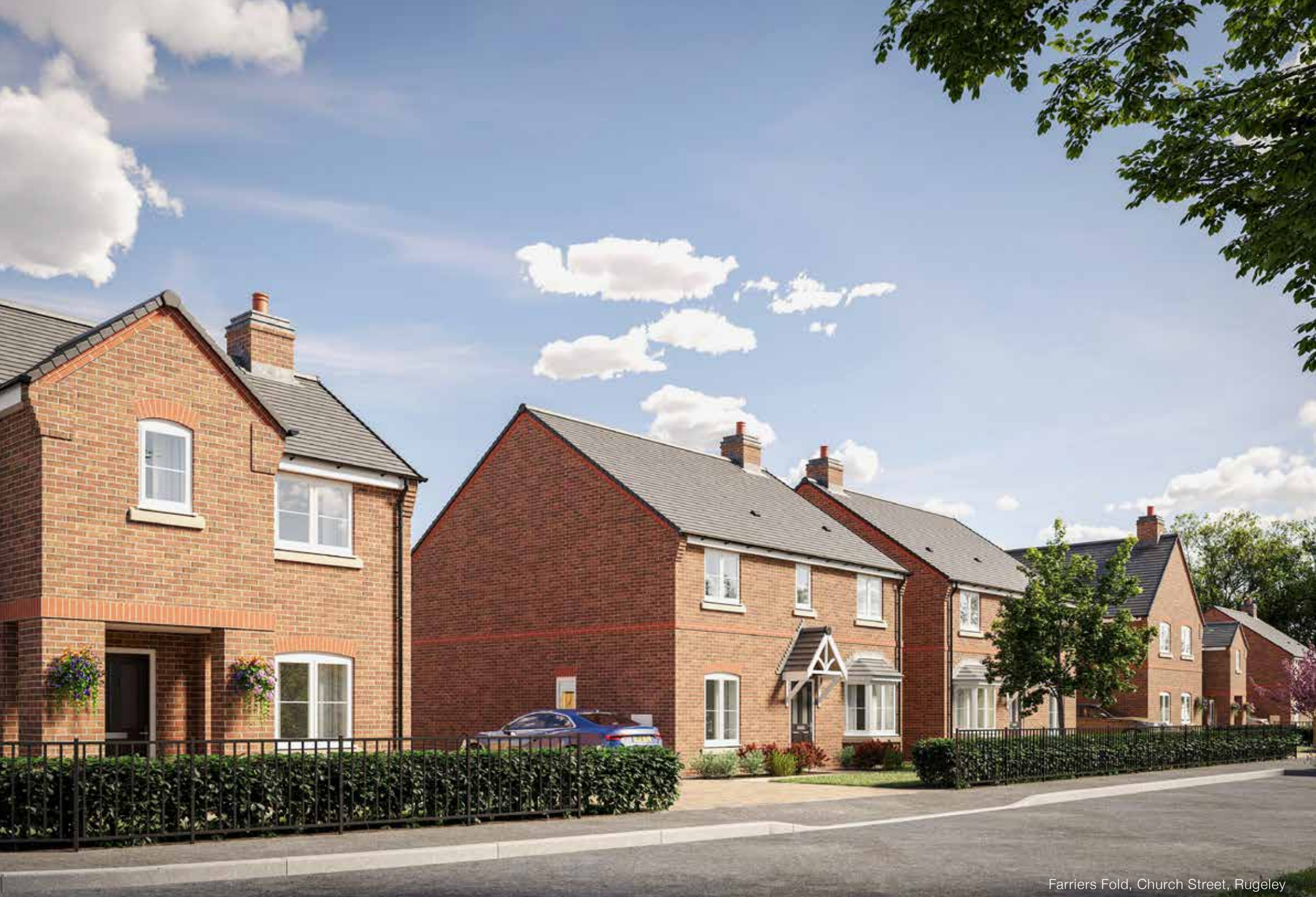
Farriers Fold, Church Street, Rugeley