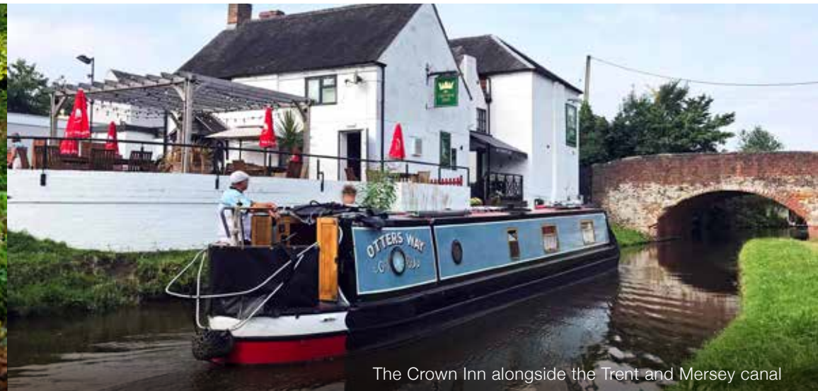
The Crown Inn alongside the Trent and Mersey canal

Farriers Fold is a great location for outdoor lovers. With the stunning Cannock Chase nearby, you can enjoy an abundance of walking, cycling, and hiking opportunities.