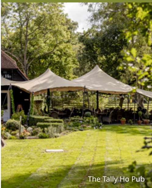
The Tally Ho Pub

With schools, a supermarket, leisure centre, community centre and open space all on your doorstep, a home at this attractive development provides the perfect balance for a better quality of life.