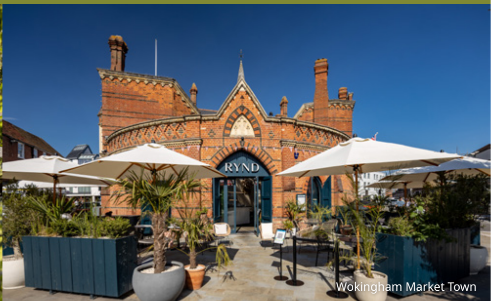
Wokingham Market Town