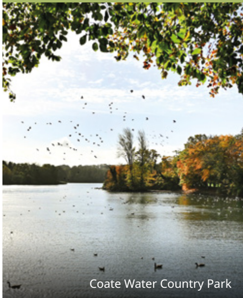
Coate Water Country Park