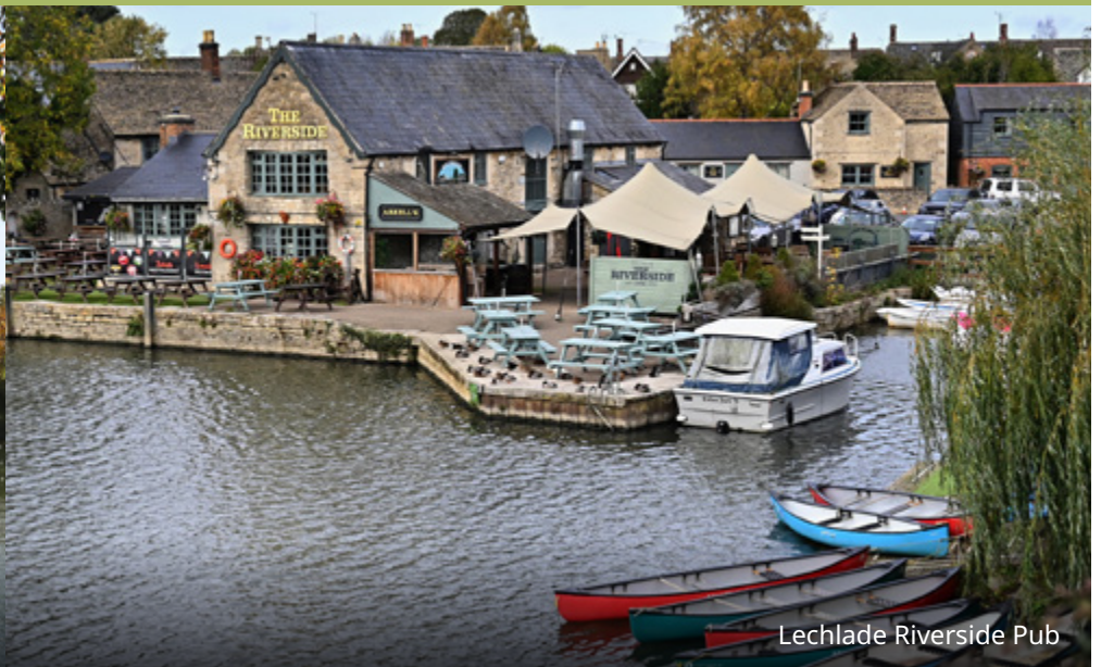
Lechlade Riverside Pub