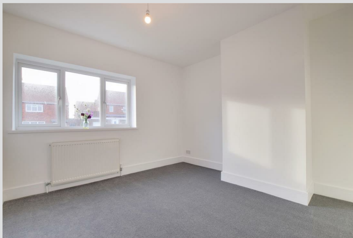
Bedroom 2 11'3" x 10'5" into alcove

Double glazed window to front and radiator.