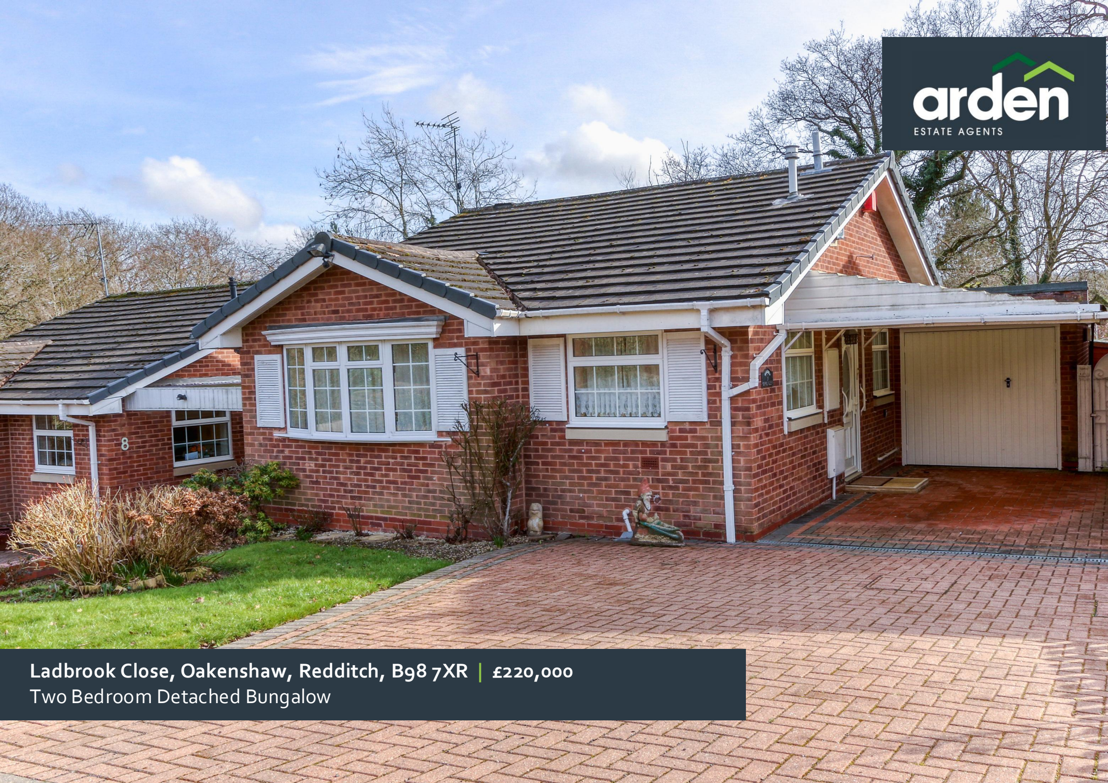
Ladbrook Close, Oakenshaw, Redditch, B98 7XR | £220,000 Two Bedroom Detached Bungalow