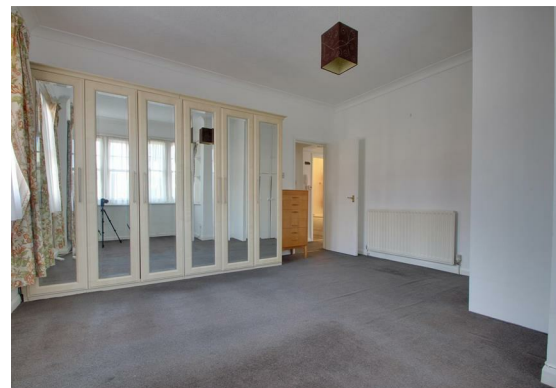
Bedroom 14'7 x 15'4 (4.45m x 4.67m)