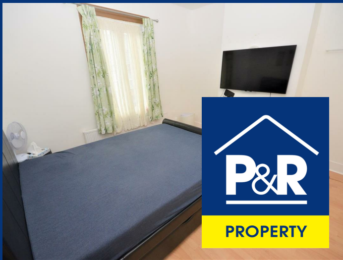
128 Hartley Road, Luton, Bedfordshire, LU2 0HY £895