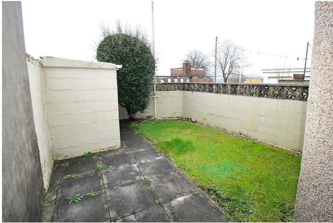
Patio and lawn area with concrete shed.