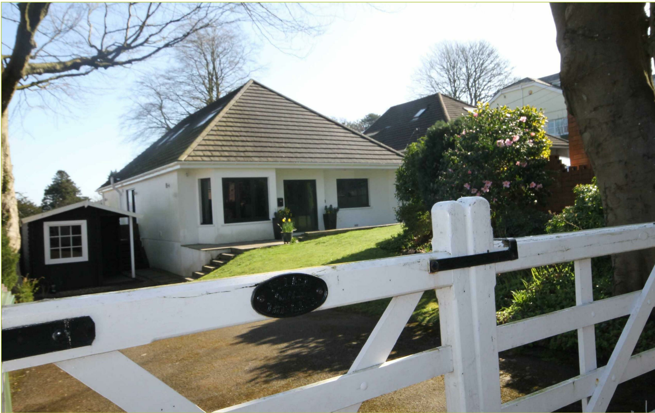
Rectory Close, Caerphilly, CF83 1EQ £530,000