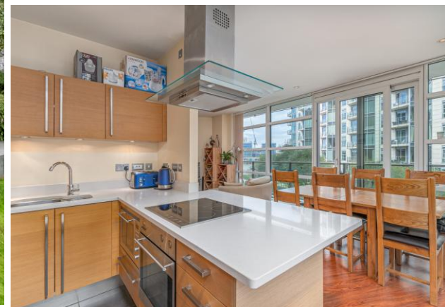
Kingfisher House, Battersea Reach, SW18 Two Bedroom Apartment

MARTIN&CO Chelsea • Battersea • Riverside