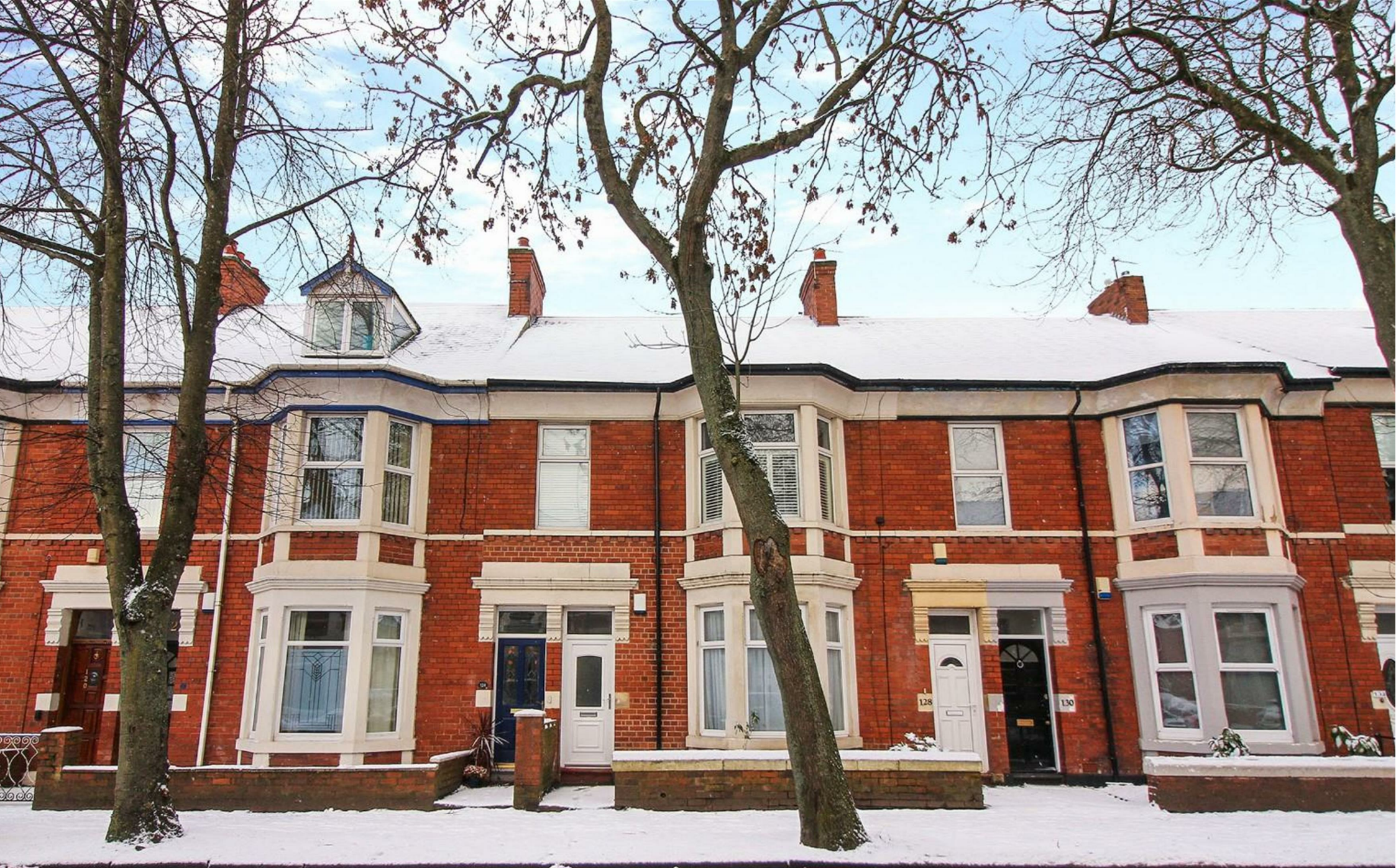
📍 Queen Alexandra Road, North Shields NE29 9AP