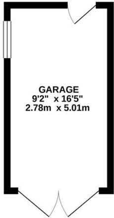
GROUND FLOOR 150 sq.ft. (14.0 sq.m.) approx.