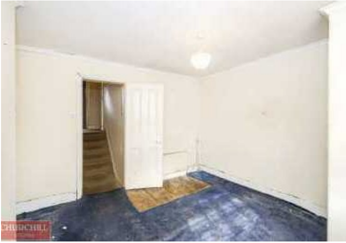
GROUND FLOOR 587 sq. ft. (54.5 sq.m.) approx.