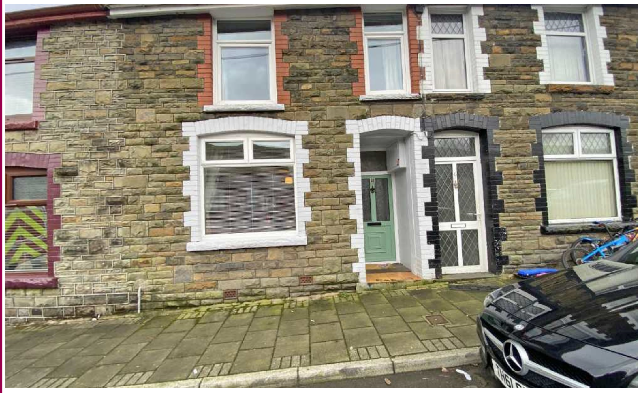
5 Glynhafod Street, Aberdare, CF44 6LD £99,995