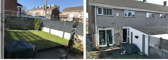
Enclosed garden with lawned and patio areas, brick built shed.