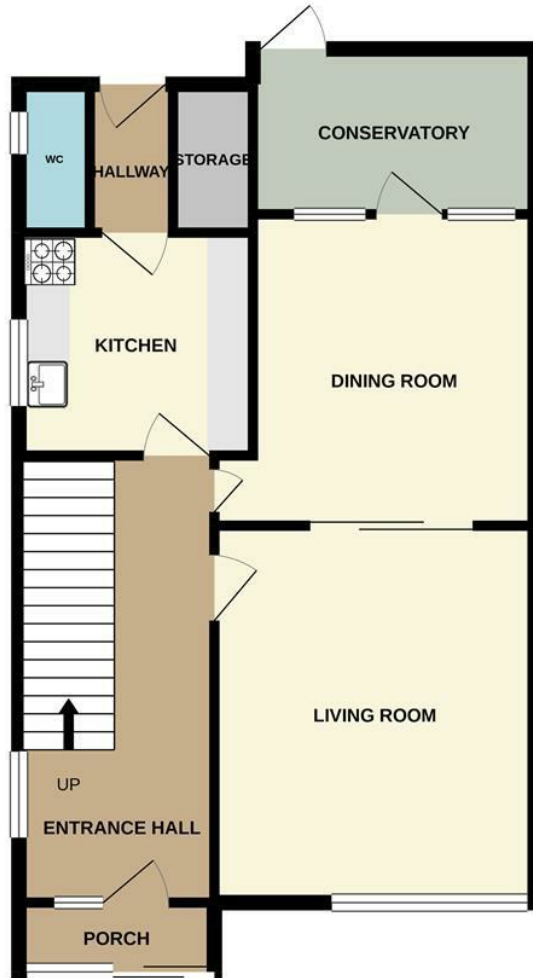
GROUND FLOOR 645 sq.ft. (59.9 sq.m.) approx.