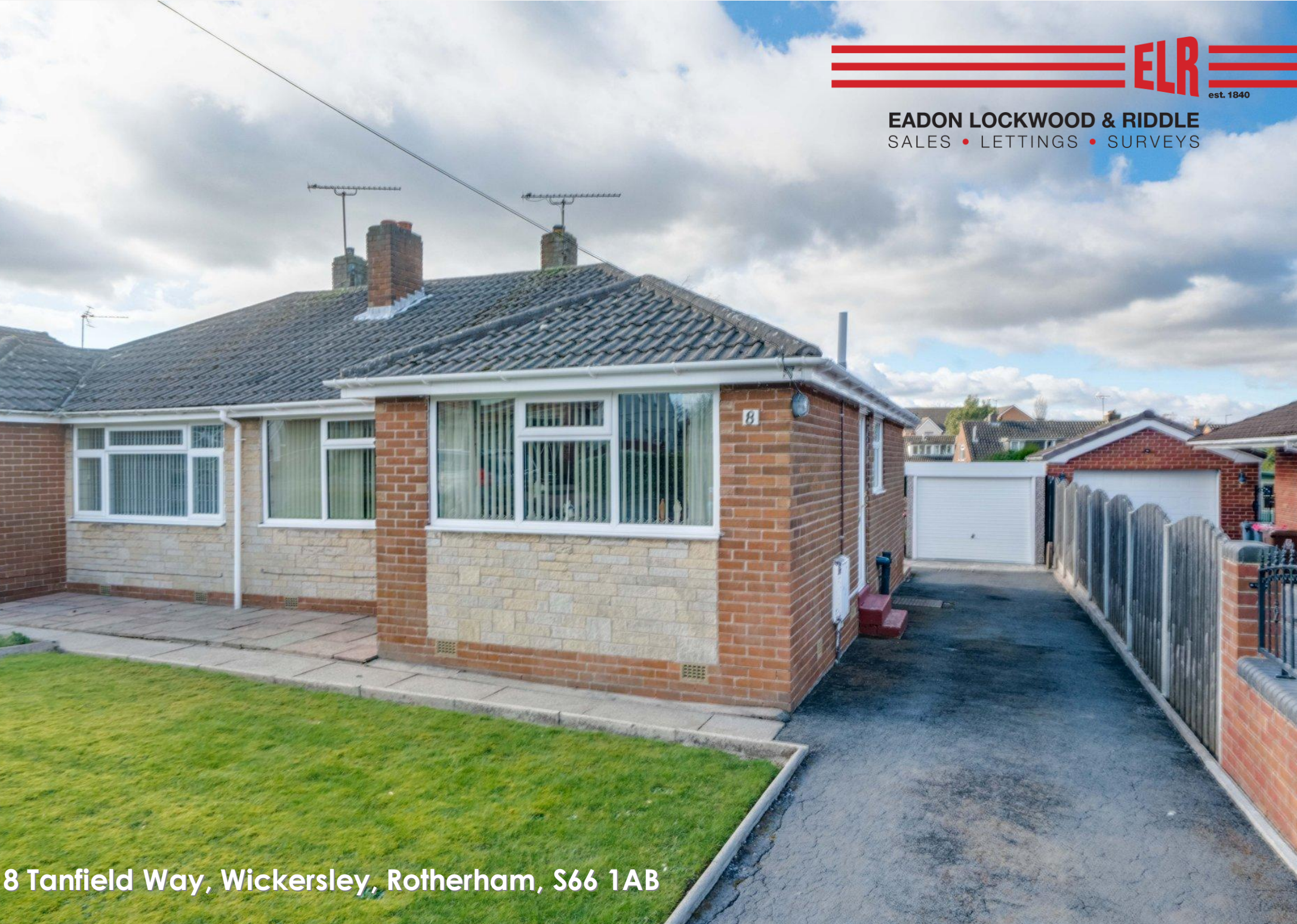
8 Tanfield Way, Wickersley, Rotherham, S66 1AB