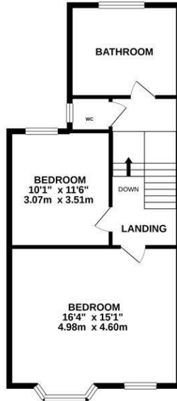
1ST FLOOR 598 sq.ft. (55.5 sq.m.) approx.