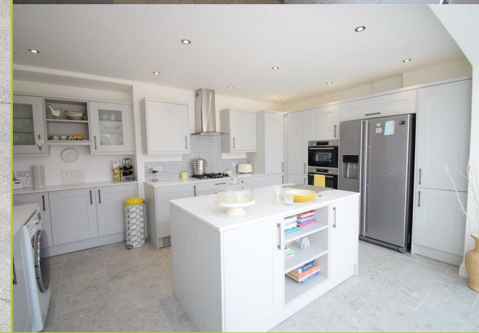
6 Lon Uchaf, Caerphilly, CF83 1BR £355,000