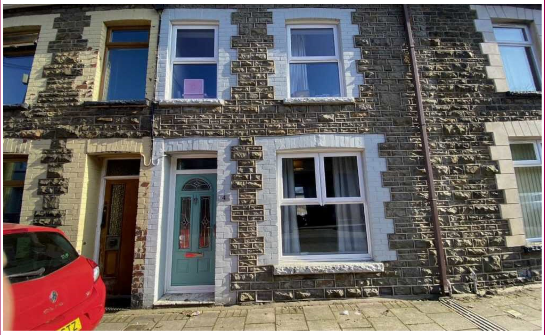
4 Godreaman Street, Aberdare, CF44 6DF £114,995