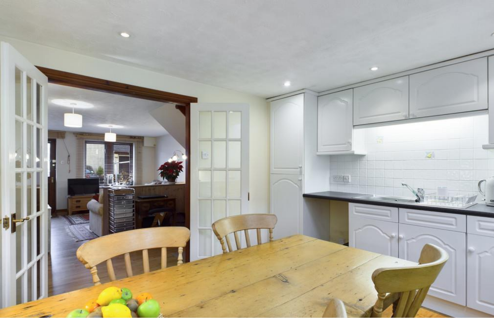
Kitchen Dining Area