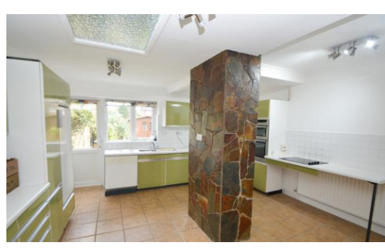
Shirley Drive, Grappenhall Warrington, Cheshire, WA4 2PA