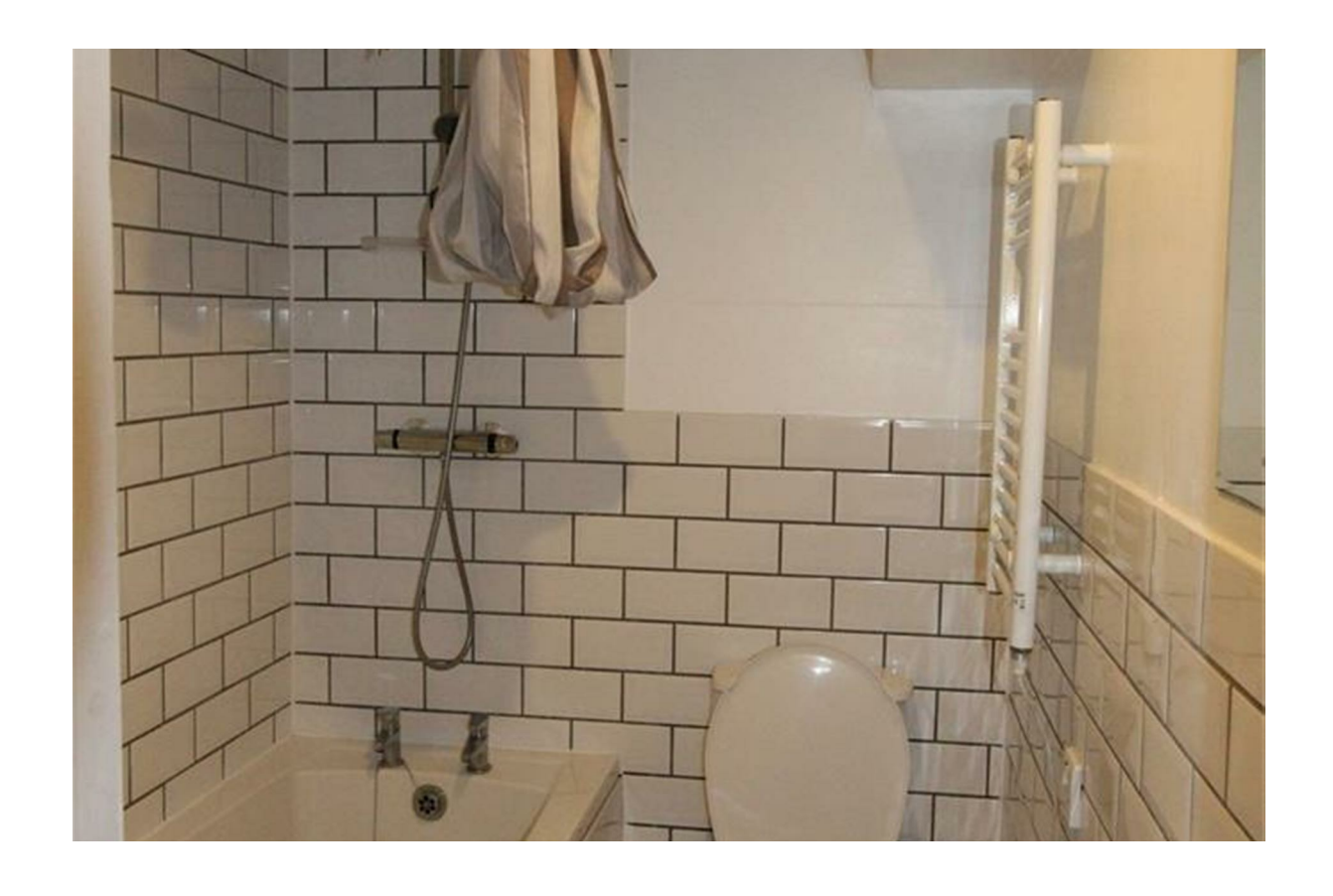
MORE @ WWW.LOVETTINTERNATIONAL.COM