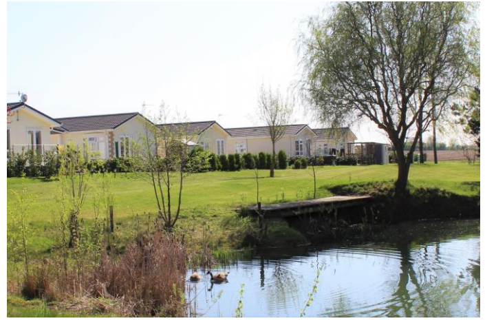
Please note: Stock images have been used, the home on site may vary.