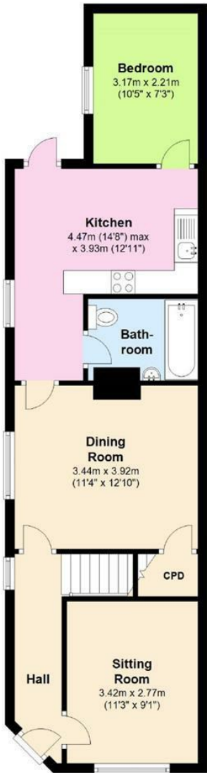
Ground Floor Approx. 55.0 sq. metres (592.5 sq. feet)