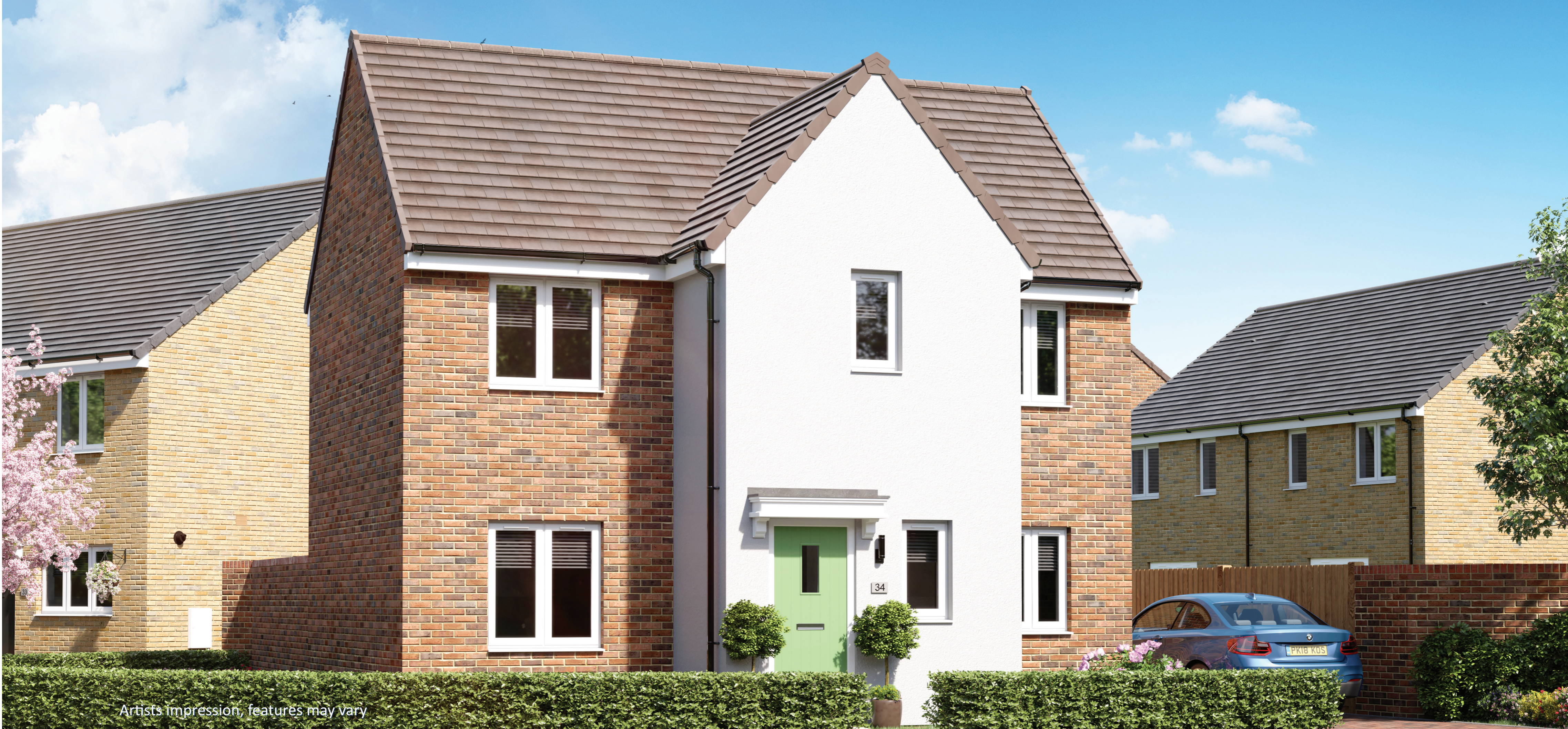
Artists Impression, features may vary