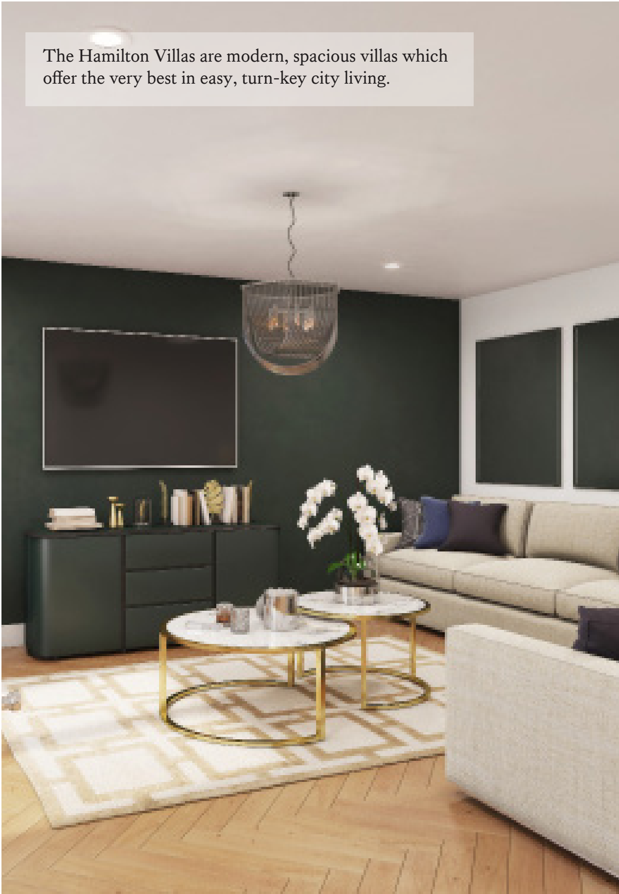
The Hamilton Villas are modern, spacious villas which offer the very best in easy, turn-key city living.