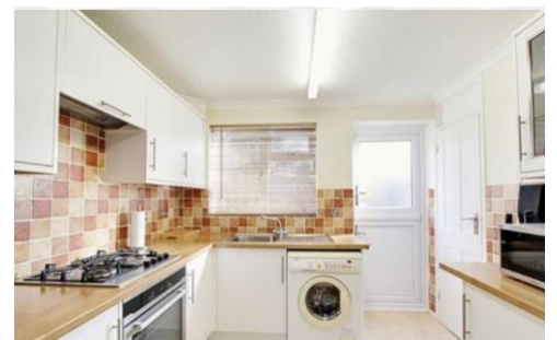
Bangor Close , Northolt, , UB5 4HD