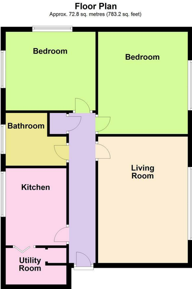
Total area: approx. 72.8 sq. metres (783.2 sq. feet)