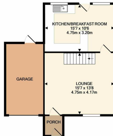
GROUND FLOOR APPROX. FLOOR AREA 530 SQ.FT. (49.3 SQ.M.)

A four bedroom terraced house to rent in a popular location in Westbury, benefiting from allocating parking and a garage. The house includes a large living room, separate kitchen/diner and four bedrooms, three of which are doubles.