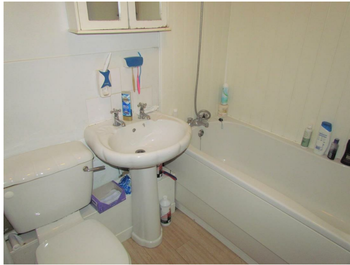
Three piece suite