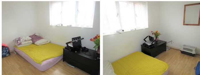
Double Bedroom. Wooden flooring.