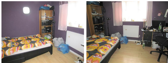
Double Bedroom. Wooden flooring.