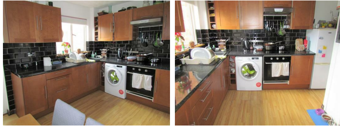
Oven and hob. Tiled flooring.