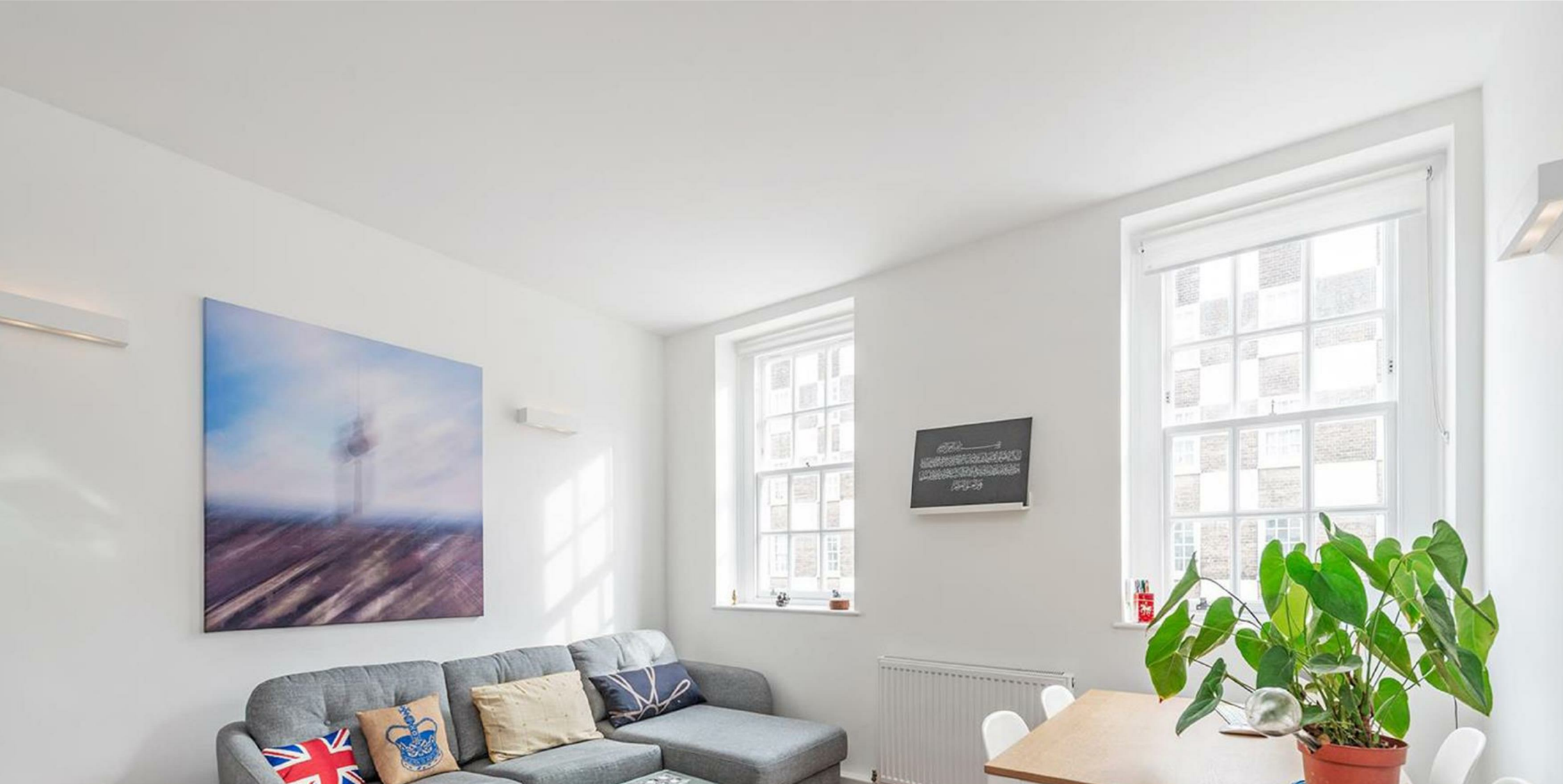
Edric House, Westminster London SW1P