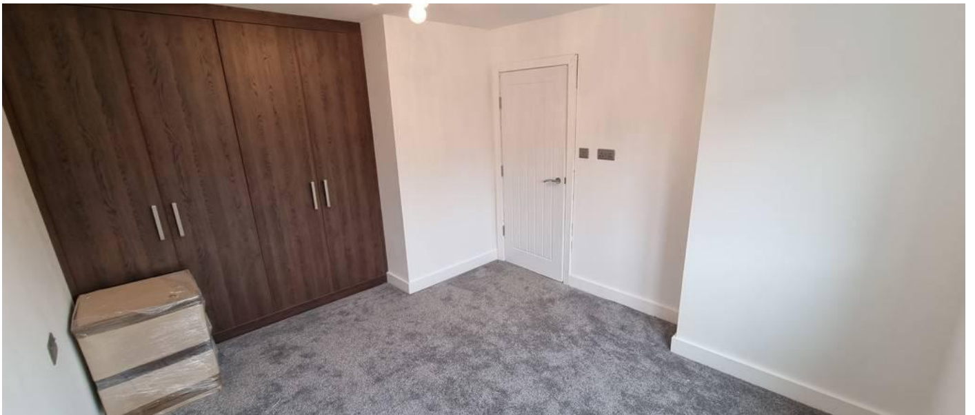
Bedroom two: 11'5 x 10'2