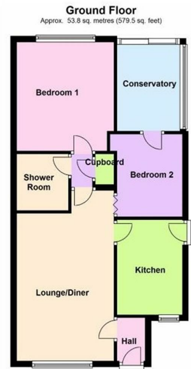
Total area: approx. 53.8 sq. metres (579.5 sq. feet)